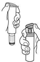
1. Remove protective caps.